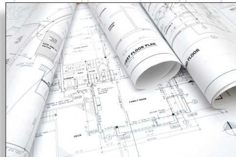
Custom-built to your specs

“Whether you need 10 lockers or 1,000 lockers, we’ll design, produce and ship in less time than any other locker manufacturer.”